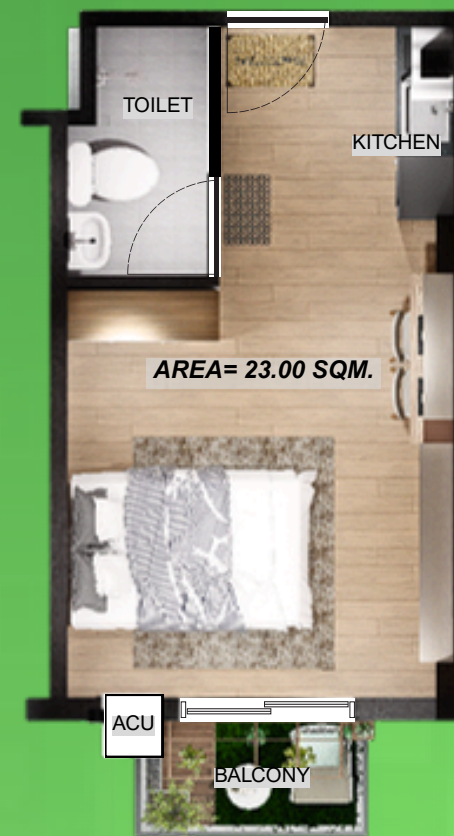
STUDIO UNIT 23.00sqm