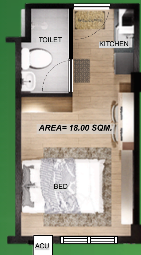
STUDIO UNIT 18.00sqm