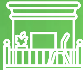
With or Without Balcony