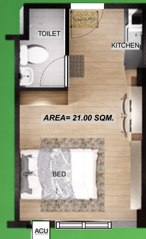
STUDIO UNIT 21.00sqm