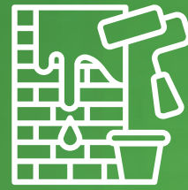
Wall Finished (wall acrylic paint)