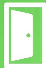
Mahogany Painted Door